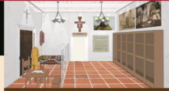
The Franciscan Journey